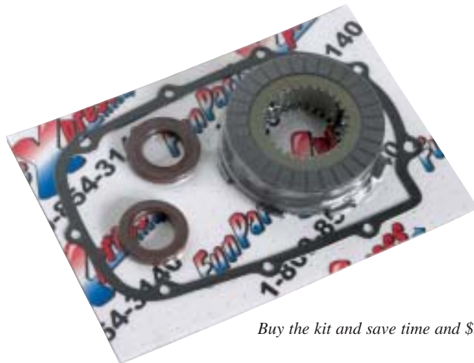
Buy the kit and save time and $$$