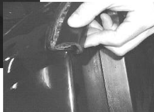
Step 3: Apply by pressing trim firmly against body.

Warranty: The normal warranty applies. Updated parts will